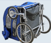
12. Wheel side storage