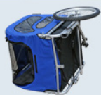
6. Push-in wheels