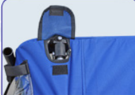
5. Lock with pin