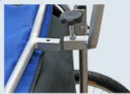
10. Secure to center tube