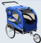
11. Completed setup