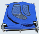
1. Lay trailer flat